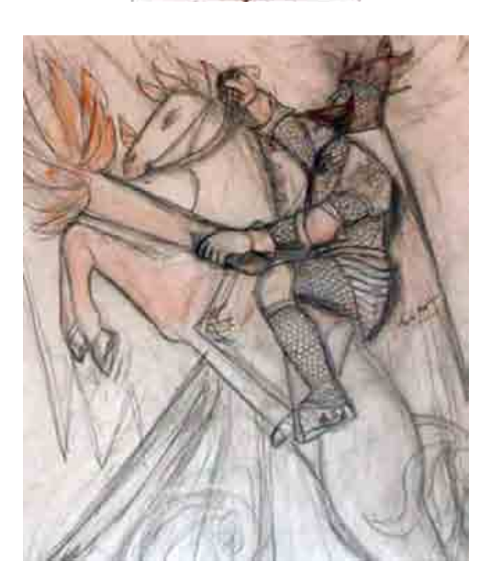
Knight of Wands.