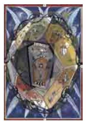
Masonic IIIº Degree.