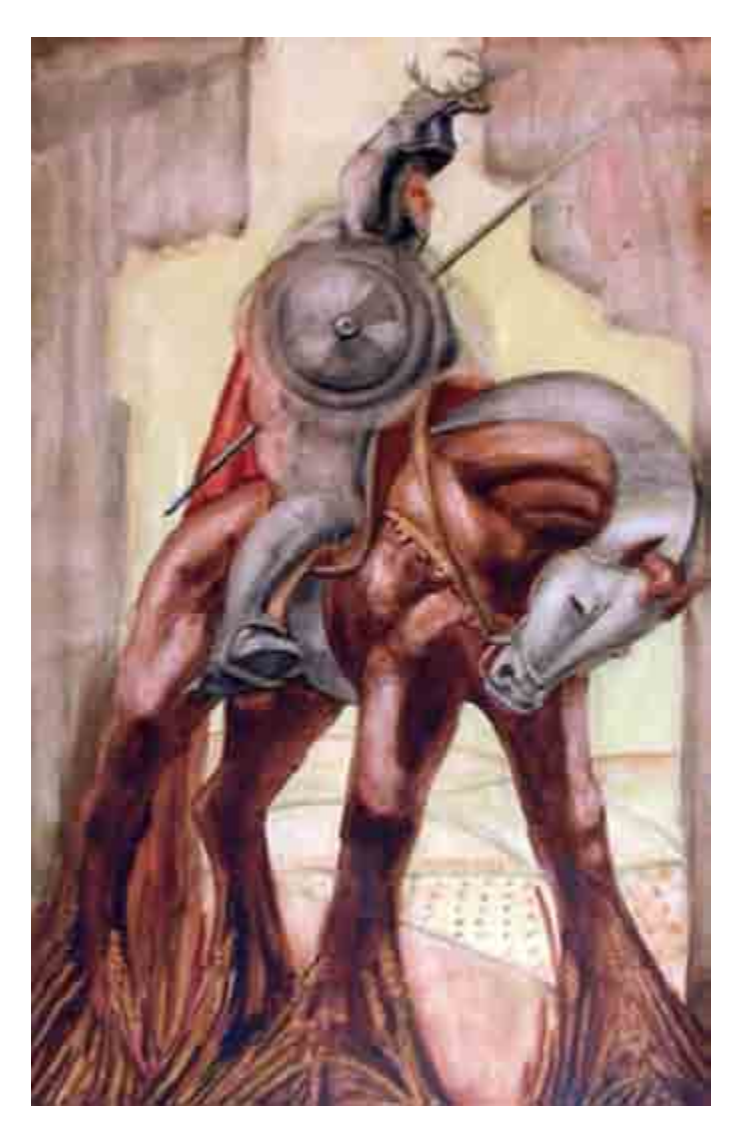
Knight of Discs.